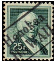
2.615, and another, heavier impression